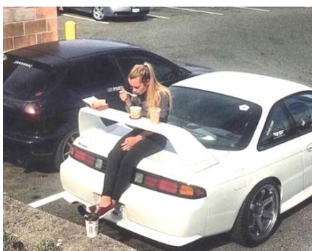
Finally, I understand why some cars have these things.